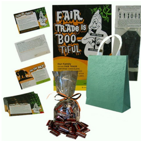
Reverse Trick or Treating