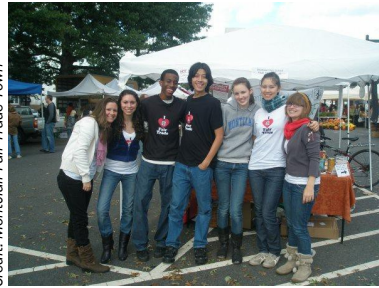
Montclair, NJ, Fair Trade Club spreading Fair Trade at expo

Since many people don’t know what Fair Trade really is, you can serve as an effective ambassador for Fair Trade with lots of easy and fun ways to introduce Fair Trade such as: