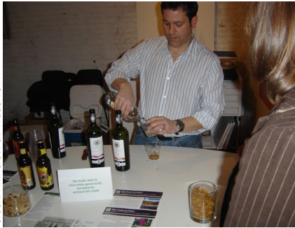
Tasting Fair Trade Wine

It is very easy and rewarding to buy Fair Trade products, both online or in a store. Scores of quality products are available from major retailers as well as from small businesses. Fair Trade items are great values for kids and adults, home and office, regular days and special occasions. Many products and retailers are listed in the section “Fair Trade By Some Numbers.” A few good ways to shop Fair Trade are: