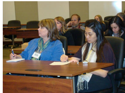
Newcomers and advocates participate in a Fair Trade Federation seminar