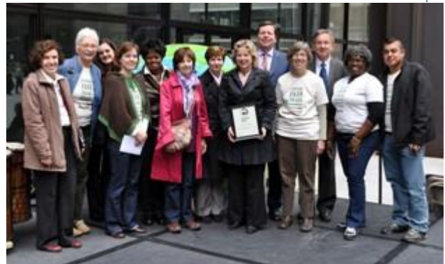
Chicago FTT advocates

Chicago in May became the largest Fair Trade Town in the United States and the second largest in the world.